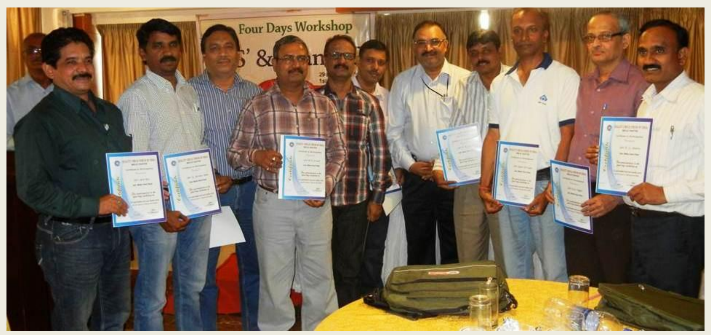
QCFI,BHILAI CHAPTER TRAINING ACTIVITIES- FOUR DAYS WORSHOP ON TRAINING FOR TRAINERS PROGRAMME